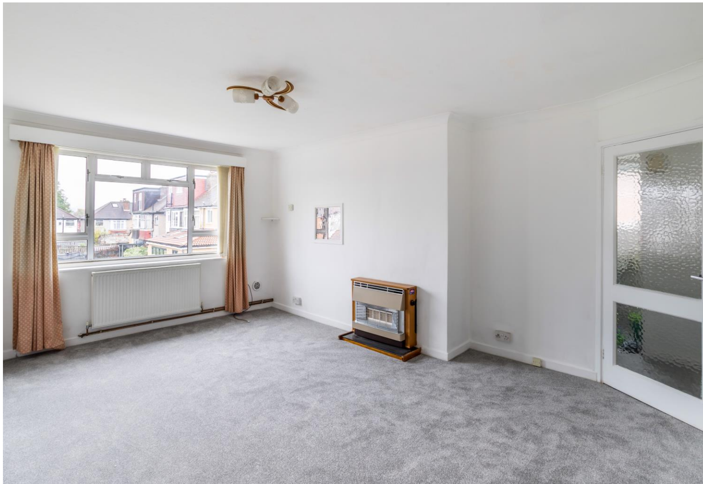
Sitting / Dining Room 16' 4" x 12' 6" (4.97m x 3.81m) Rear aspect, gas fire.